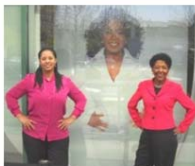
Torri, and I in front of a bigger than life photo of Oprah